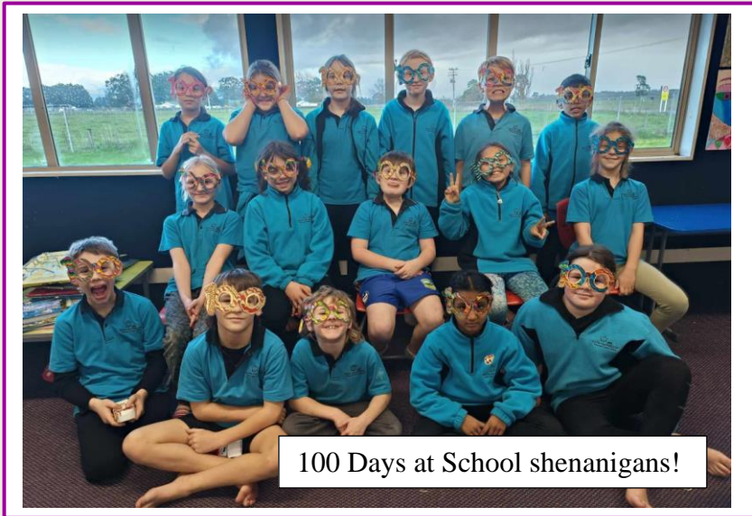
100 Days at School shenanigans!