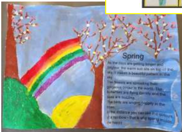
Aaleyah's 'Spring' writing!