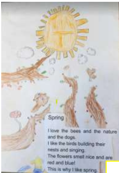
Rylan's "Spring" writing