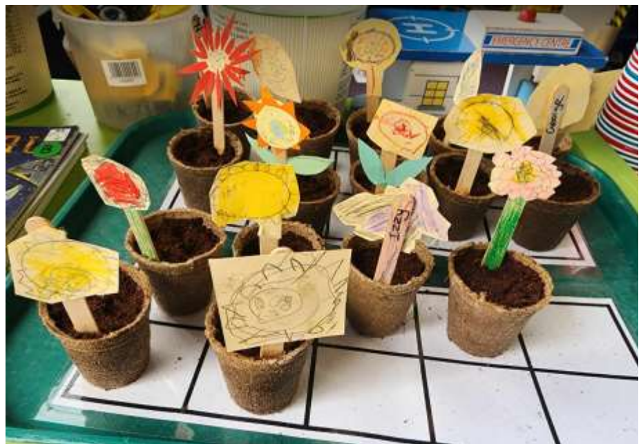
Our Junior Room ākonga are growing sunflowers! (Watch this space . . .)