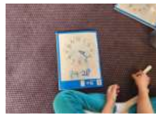
Learning how to tell the time 'digitally'!