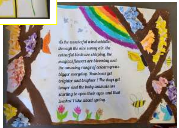
Aleyna's 'Spring' writing!