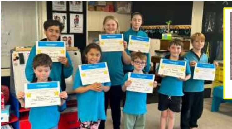
Key Competency awards: "Thinking" and "Participating & Contributing"