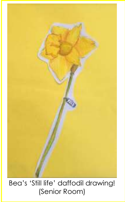
Bea's 'Still life' daffodil drawing! (Senior Room)