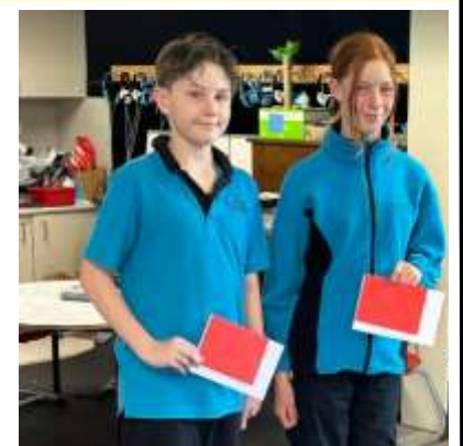
Two of Three Highly Commended in the 2024 Chicken & Frog Poetry Competition, Topic: "My Town"