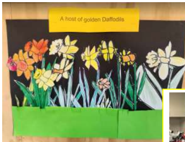
LJR's gorgeous daffodils!