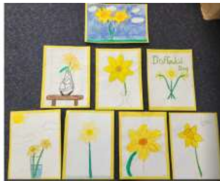
Senior Room's 'Spring' drawings