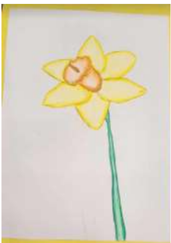
Hailey's 'Still life' daffodil drawing! (Senior Room)